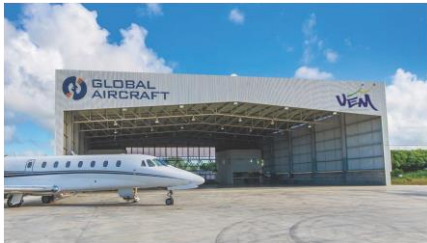
Salvador, BA – Brazil Hangar Vem Aviation